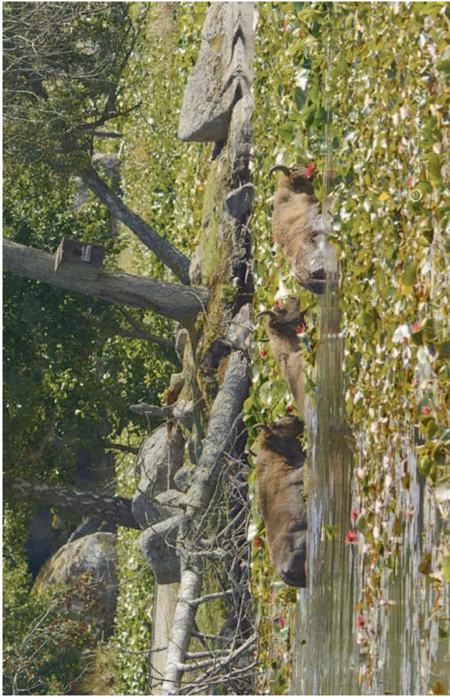
European bison eating water lily

Eriksberg 2016